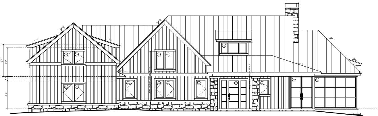
ENTRY EXTERIOR ELEVATION