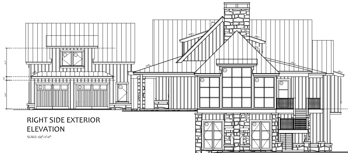
RIGHT SIDE EXTERIOR ELEVATION