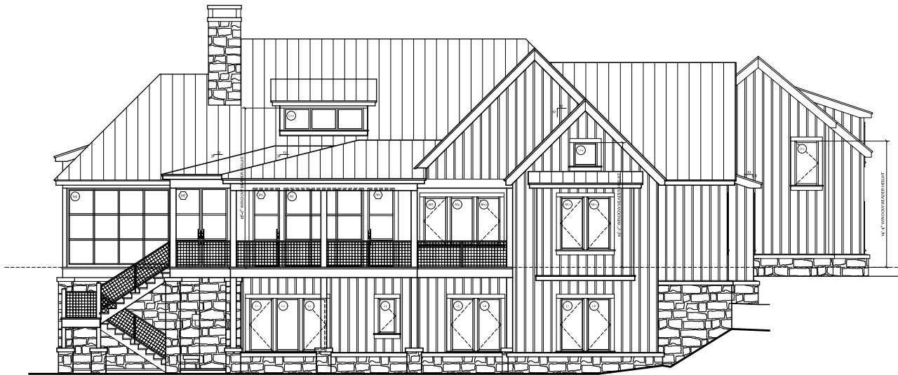
REAR EXTERIOR ELEVATION